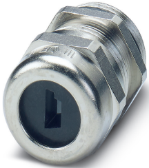
Metal screw connection for an AS-Interface flat-ribbon conductor, thread type M20

Please be informed that the data shown in this PDF Document is generated from our Online Catalog. Please find the complete data in the user's documentation. Our General Terms of Use for Downloads are valid ( http://phoenixcontact.com/download )